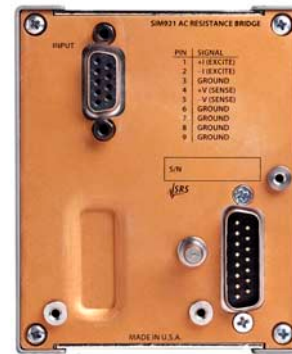
SIM921 rear panel

All instrument parameters can be controlled and displayed on the front panel or set and queried over the computer interface. The analog DC output is available on a front-panel BNC connector.